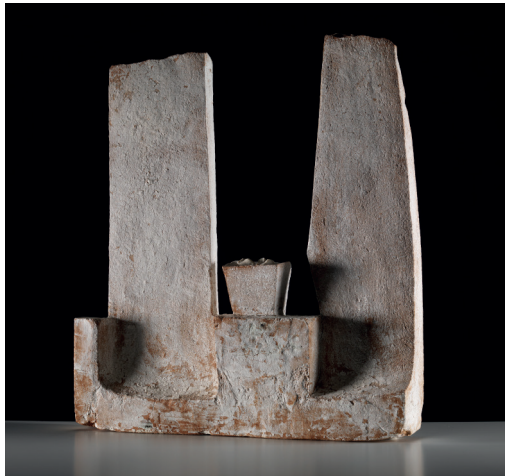
Fernando Casasempere, Natura Morta , 2018 Stoneware and porcelain, 66 × 57.5 × 10 cm © Fernando Casasempere 2018. Courtesy Parafin, London

— Private view: Thursday 22 November, 6-8pm