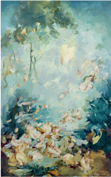
Flora Yukhnovich, Nobody Puts Baby in a Corner , 2018 Oil on canvas, 270 × 170 cm. Private collection, London © Flora Yukhnovich 2018.

For further details and images please contact: