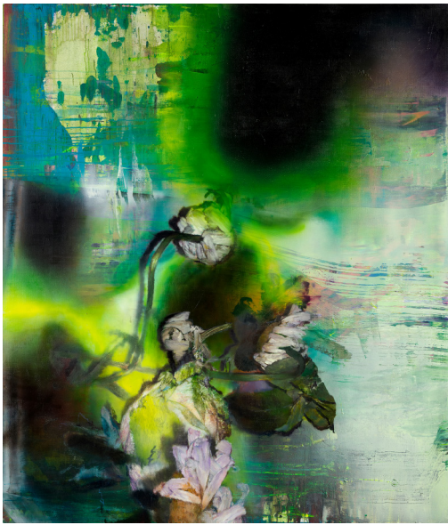
Justin Mortimer, Breed 6 , 2018 Oil and acrylic on canvas, 213 × 183 cm. © Justin Mortimer 2019. Courtesy Parafin, London

For further details and images please contact: