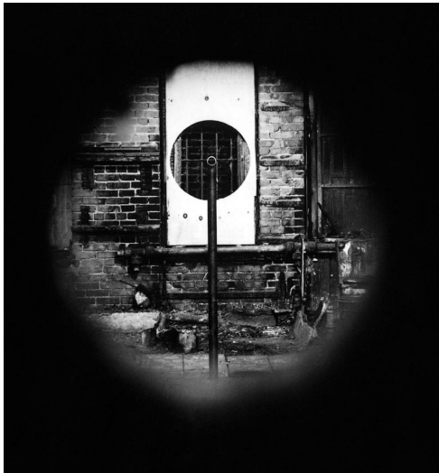
Nancy Holt Crossed Locators (detail), 1972 Four locators: 152.4 × 30.5 × 5.1 cm (60 × 12 × 2 in) each Courtesy the Estate of Nancy Holt Photograph by Peter Moore © Estate of Peter Moore / VAGA, New York

Private view: Thursday 08 October, 5–8pm