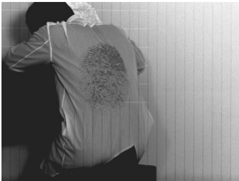
Hiraki Sawa, Man in Camera (video still), 2016 Single channel video, drawings, mixed media, installation 8'50" duration

Parafin is delighted to announce the gallery's first exhibition with the acclaimed Japanese artist Hiraki Sawa (born 1977 Ishikawa, Japan). Hiraki Sawa is known internationally for videos and installations that create powerful psychological situations by interweaving the domestic and the fantastic. Characterised by quietness and introspection, Sawa's works create compelling interior worlds and meditate upon themes of memory and displacement. Sawa has the ability to manipulate his imagination into a tangible dimension that sits between the parallel languages of sculpture and film.